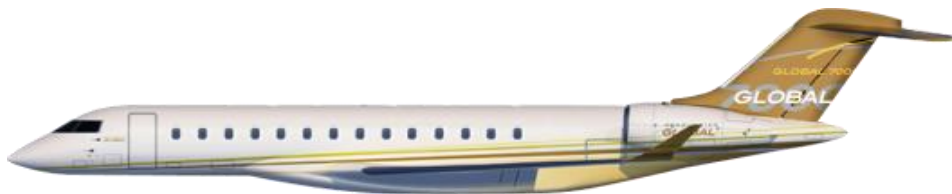
The Global 7000 jet

For its Global 7000* & Global 8000* aircraft fuselage, BOMBARDIER HAS CHOSEN AEROLIA